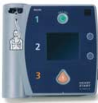
HeartStart FR2+ Defibrillator