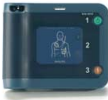
HeartStart FRx Defibrillator