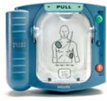
HeartStart OnSite Defibrillator

Forward-thinking organizations and communities are establishing early defibrillation programs in shopping malls, airports, businesses, health clubs, casinos, and across entire towns and cities. Now you can empower your organization with the same confidence, peace of mind and invaluable preparedness.